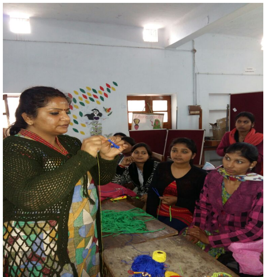
Students at a workshop organized by the Department of Home Science