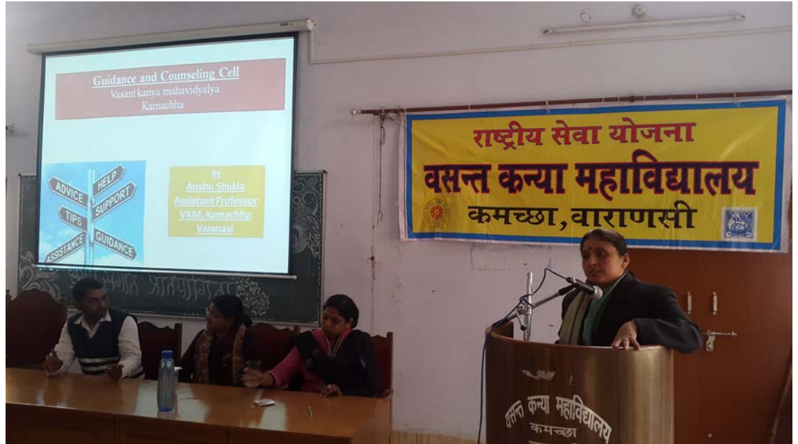
Information given to students during NSS regarding Guidance and Counselling