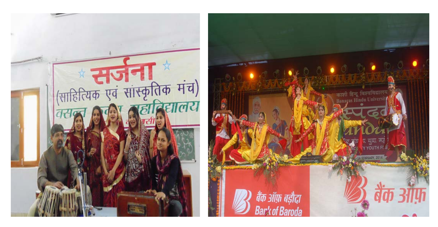
Students in the cultural forum of the College- Sarjana