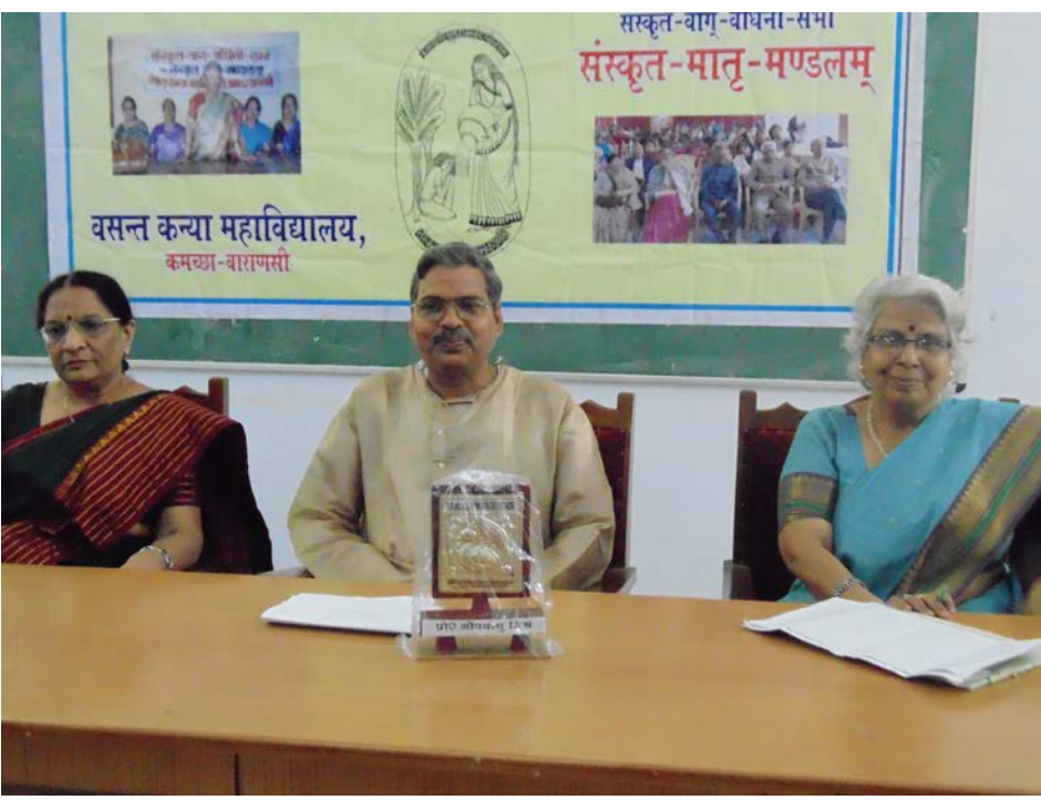
Eminent speakers in a porgramme of Sanskrit Matri Mandalam