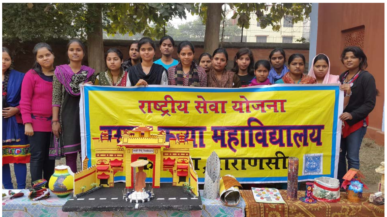
Students displaying their creativity during NSS